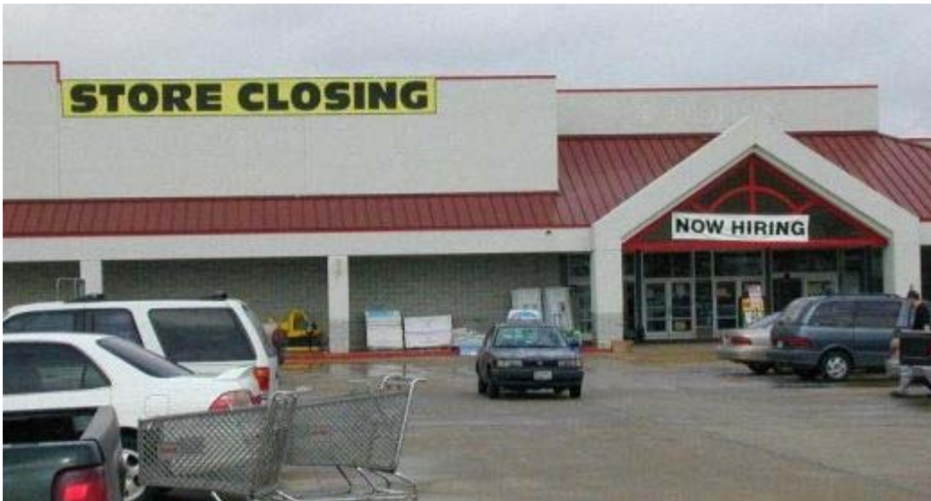
Make up your mind!!!