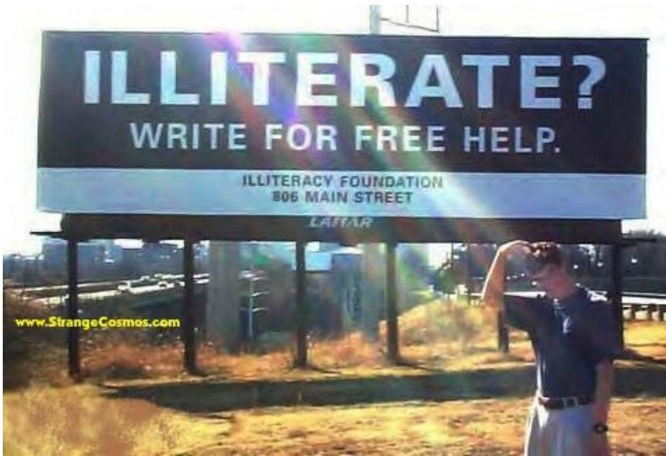
How can I write if I'm ILLITERATE!!!!