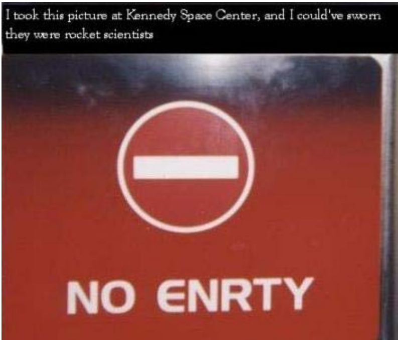
Speling iz knot imprtunt fir astranawts