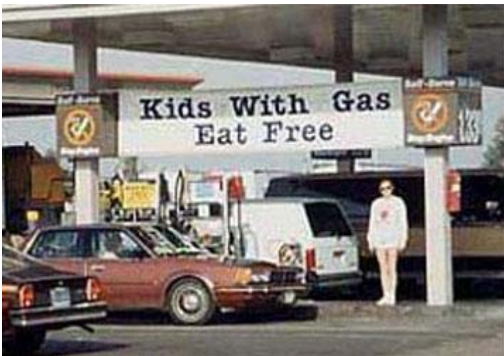
Load 'em up with burritos, Mom!!