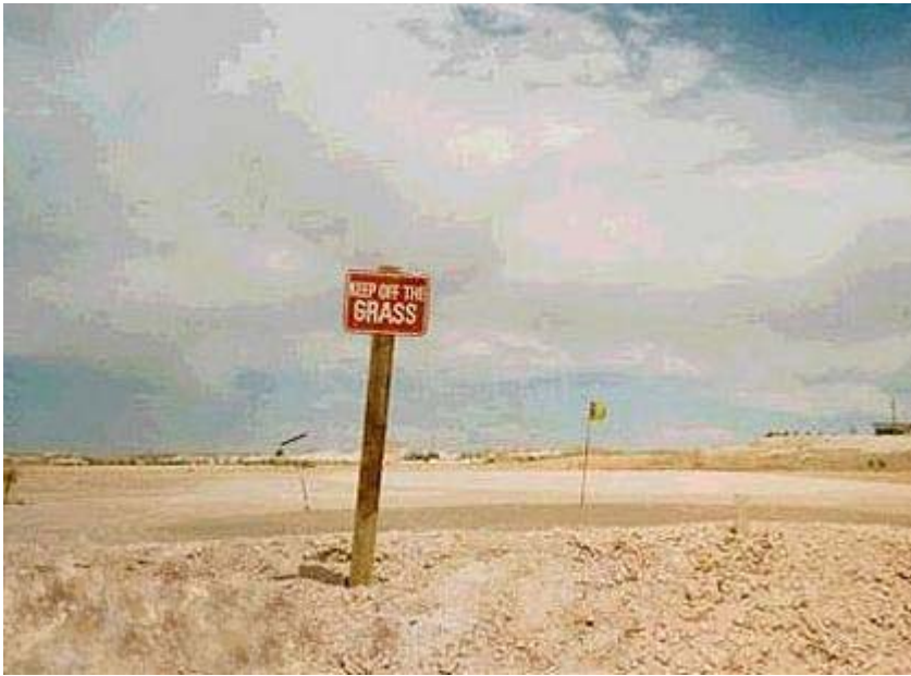
Beautiful, lush lawns of dirt...