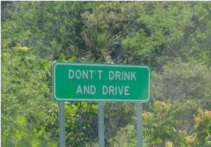
Don't drink and make signs...